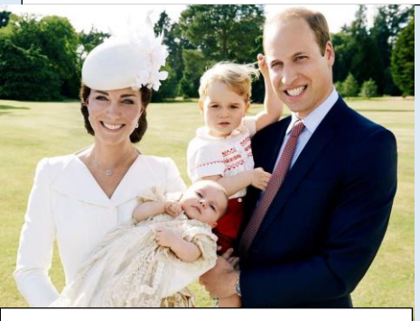
The Duke and Duchess of Cambridge