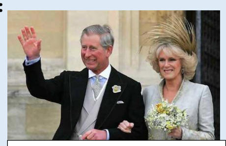
Prince Charles & Camilla