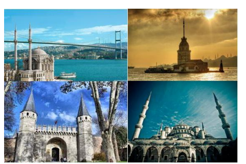
Istanbul is a megacity, as well as the cultural, economic, and financial centre of Turkey. It is the only city in the world located on two continents.