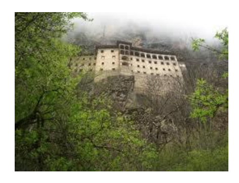
SUMELA VIRGIN MARY MONASTERY