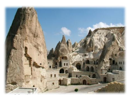
CAPPADOCIA WITH FAIRY CHIMNEYS