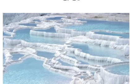
PAMUKKALE, hot springs travertines